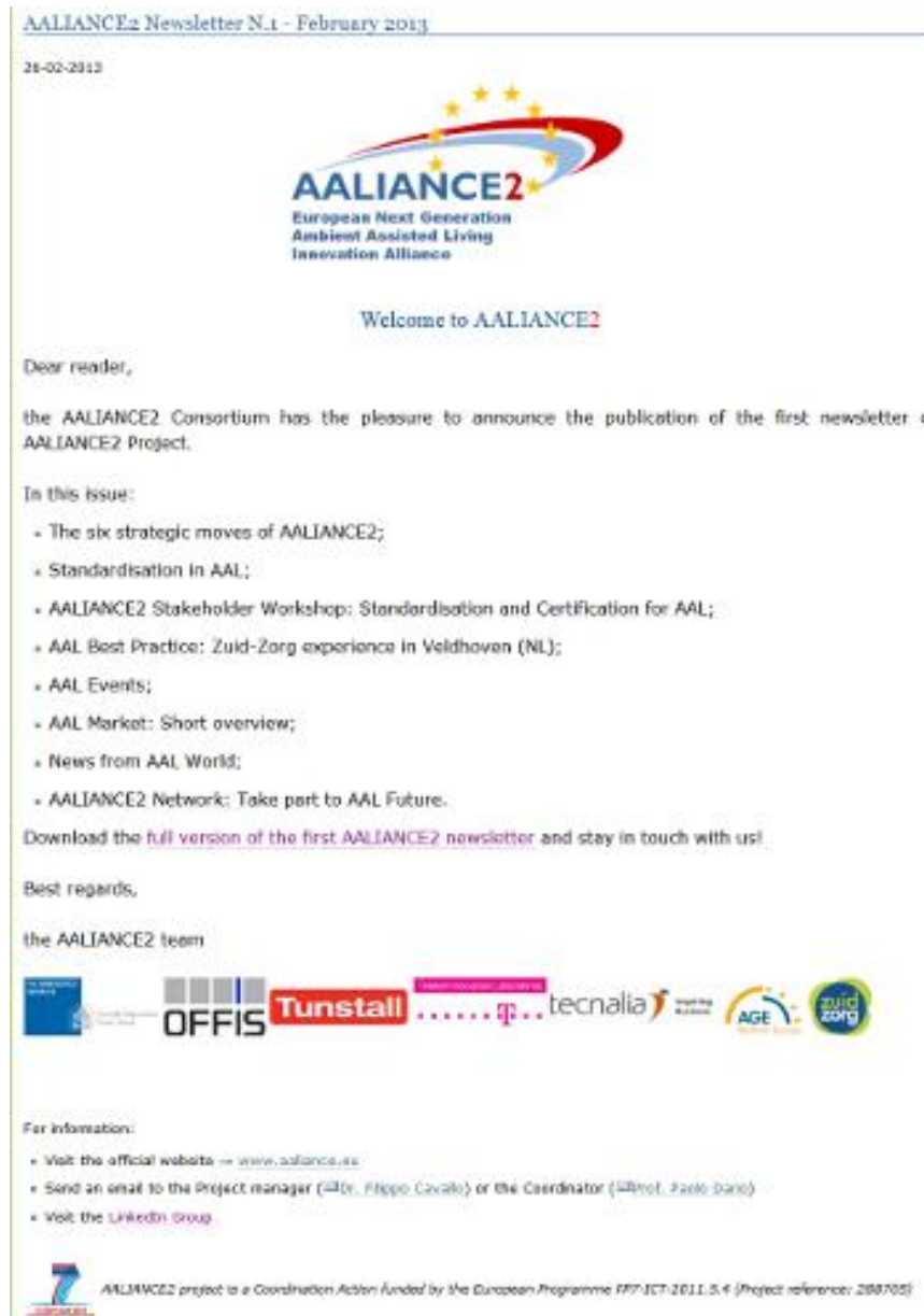
Figure 1: Content of the email version of the 1st newsletter

The short email version of the newsletter has been sent through the service provided by the website to a mailing list of 586 contacts.