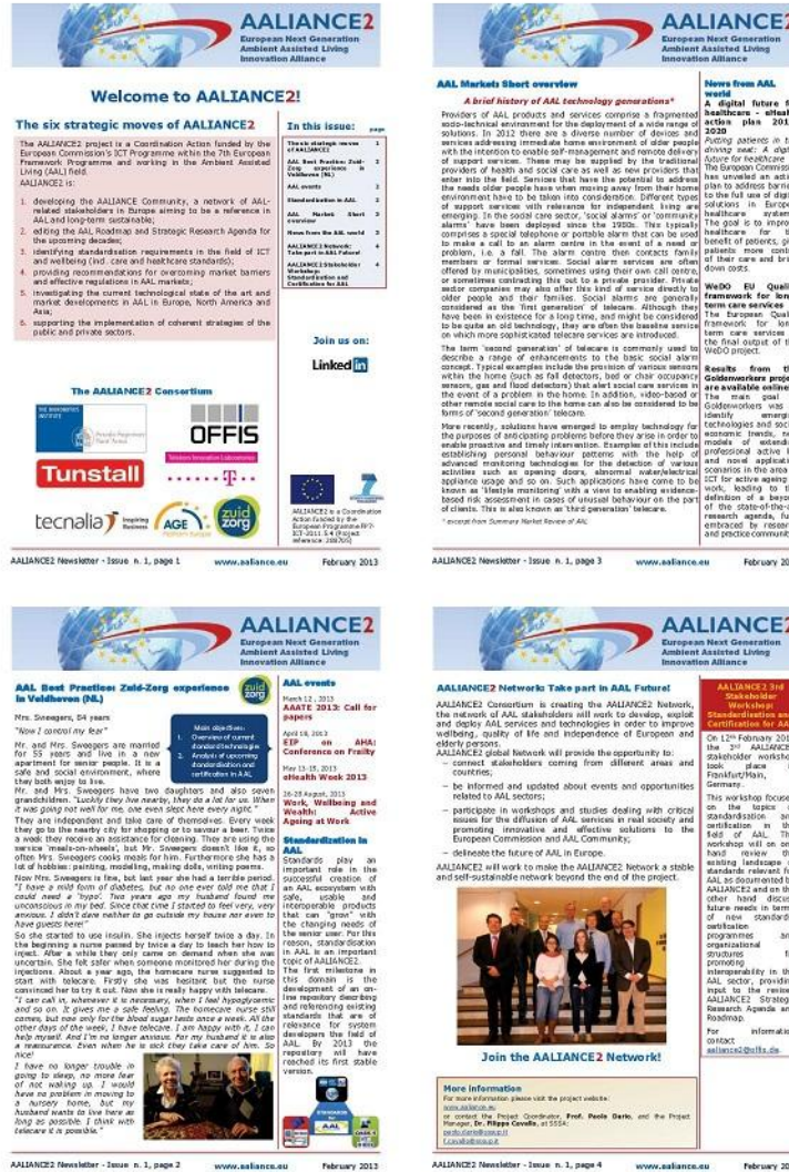
Figure 3: Print version of the 1 st AALIANCE2 newsletter